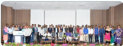
Feedback session during IIRS User Interaction Meet (UIM)-2023

IIRS takes continuous feedback from participating institutions to improve the quality of future courses.