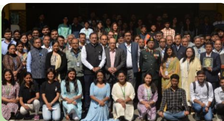
Feedback session during IIRS Academia Meet (IAM)-2024

IIRS takes continuous feedback from participating institutions to improve the quality of future courses.